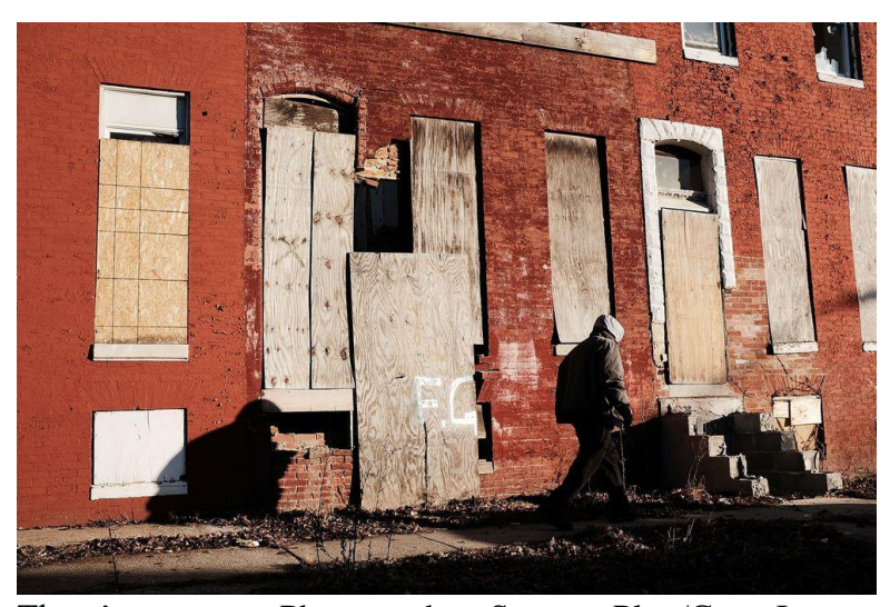
There's a reason.

One question is -- or should be -- central to any assessment of the state of America: Why, more than a century and a half after slavery ended, does the typical black family remain so much poorer than the typical white family?